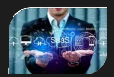
SLA Management System