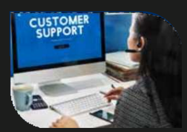
Helpdesk Management System