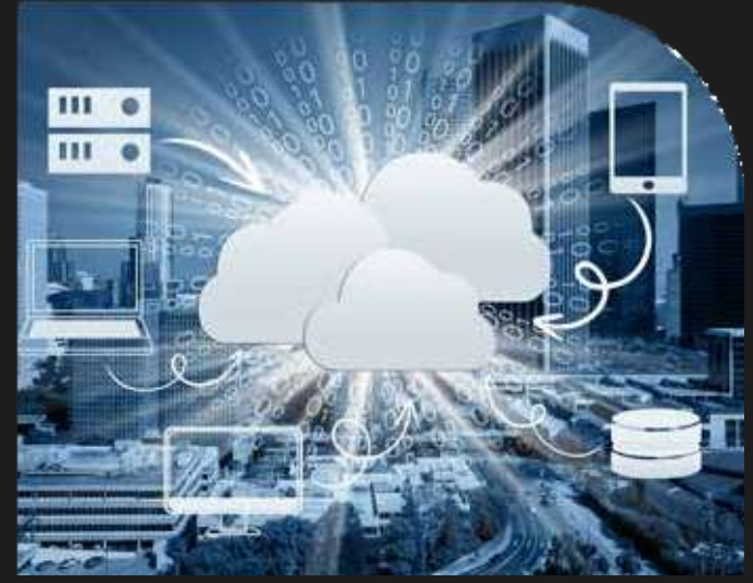
ALIGN SALES & MARKETING

We believe in the continuous growth by following the these rules.