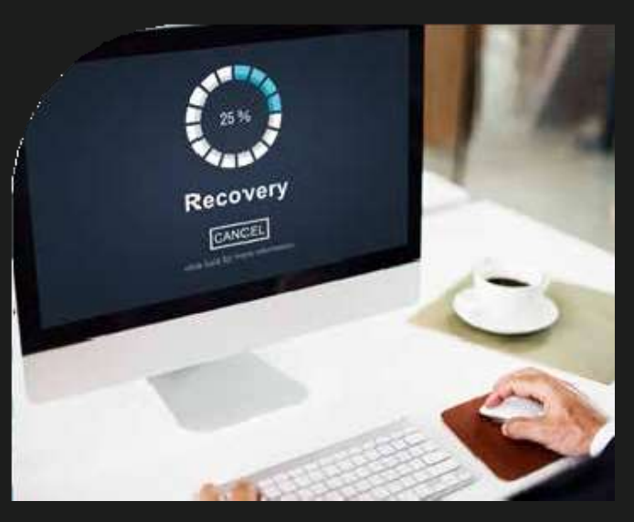
FOCUS ON BUSINESS STRENGTH