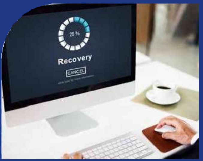
DISASTER RECOVERY SITE IMPLEMENTATION

At our IT solution firm, we offer a wide range of data center services to ensure the reliable and efficient operation of your IT systems such as LAN Infrastructure, Power Backup Solutions (DC rectifiers, Industrial grade UPS, AVR, Solar PV solutions, PDU, ATS) ISP Data Links (Dark Core, MPLS Over GSM), Virtualization/HCI Solutions, Cybersecurity Solutions, VOIP Solutions and much more. Our state-of-the-art data centers are equipped with advanced security and monitoring systems to ensure the safety and integrity of your data. With our expert team of engineers and technicians, you can trust that your data center operations are in capable hands.