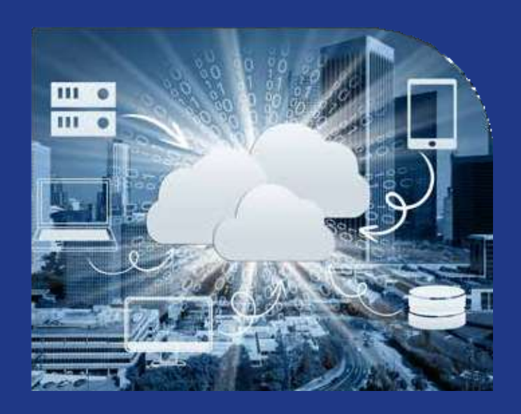
DATA CENTER MIGRATION