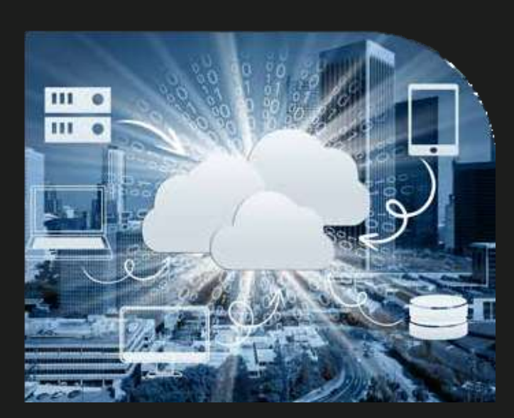
EXPAND SALES NETWORK